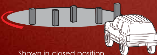
Shown in closed position, preventing access to road.